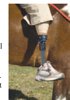
LimbLogic VS system built into a trans-tibial prosthesis

Once set by the prosthetist, LimbLogic continually monitors and maintains the desired vacuum pressure within preset limits; the wearer can adjust the pressure