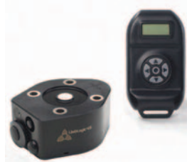
LimbLogic VS opens vacuum suspension to above-knee amputees.