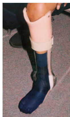
Ankle-foot orthosis with patellar tendon-bearing support.

Despite decades of progress in managing the disease, the course of diabetes still frequently culminates in varying degrees of lower-limb morbidity and ultimately amputation (see statistics). An estimated 90,000 lower-limb amputations were performed on diabetic patients in 2007 with vascular insufficiency secondary to diabetes as the predominant cause.