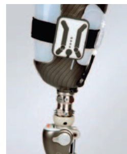
E-pulse in trans-femoral application