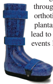
Charcot Restraint Orthotic Walker

O&P concern for diabetic patients, whether or not they have already undergone an amputation, stresses sound foot management through regular careful observation, patient education and orthotic-pedorthic support. The goal is to prevent elevated plantar pressures and trauma, which unresolved can quickly lead to plantar ulcerations, often the first insult in a series of events leading to amputation.